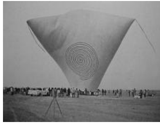
Figure 2 Julian Nott and Jim Woodman from England once flew this reconstructed primitive craft over Nazca. (Date Unknown)

This report, of course, only begins to scratch the surface of the many interesting legends and facts I discovered about the Inca's and other ancient civilizations. For instance, the reason for the existence of shapes sculpted in the landscape, large stone statues and cities created large enough to be seen from great heights. All of these can be found not only at ancient Andean sites, but also